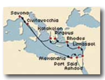
The East Mediterranean

Fares start at $2570 pp, double occupancy. Prices include cabin, port charges, taxes & fees, gratuities, workshops and dancing at night. Please visit our website for complete fare & cabin info.